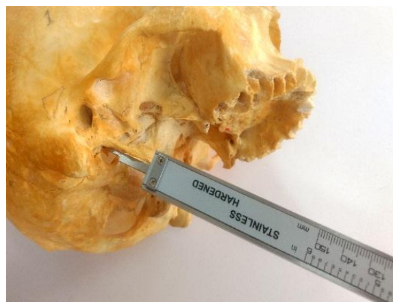
Fig. 1: Measurement of styloid process in dry human skull.

without any deformities. Broken and damaged skulls were excluded from this study. Each skull was examined carefully for the length of the styloid process. The length of the styloid process was measured from its base to the tip of the styloid process by a Digital Vernier Caliper (Aero space, Model No. DVCA150). Skulls with elongated styloid process were photographed.