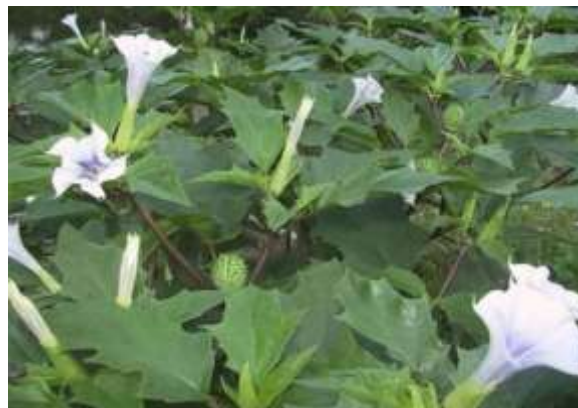
Fig. Datura stramonium L.

Division: Magnoliophyta Class: Magnoliopsida Order: Solanales Family: Solanaceae Genus: Datura Species: stramonium